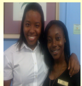
BSc. In Hospitality & Tourism Mgmt. students

(Student on the right) My internship experience was a great one... it has exposed me to all the different departments in the hotel. I learned the day-to-day operation of each department in order to meet the needs of the guests... the employees were excellent in terms of dealing with both guests and their fellow employees.