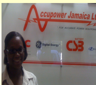
BEd. In Business & Computing student