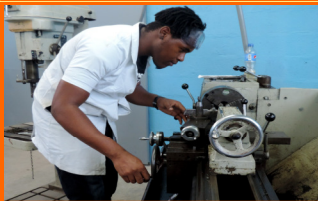
Students pursuing the B.Eng in Mechanical Engineering in a Mechanical workshop.

UTech, Ja., is purposeful in ensuring that its students' classroom experience is adequately complimented with practical sessions, thus enhancing career preparation. The photographs below show students engaged in various practical sessions.