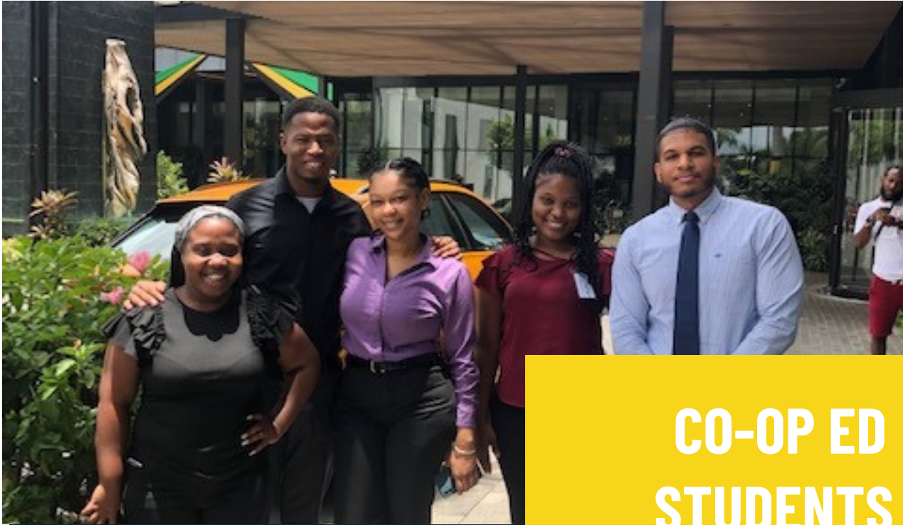
HOSPITALITY & TOURISM MANAGEMENT STUDENTS AT THE AC MARRIOT HOTEL