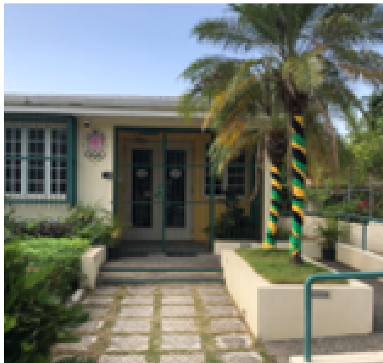
Jamaica Olympics Association Co-operative Education site